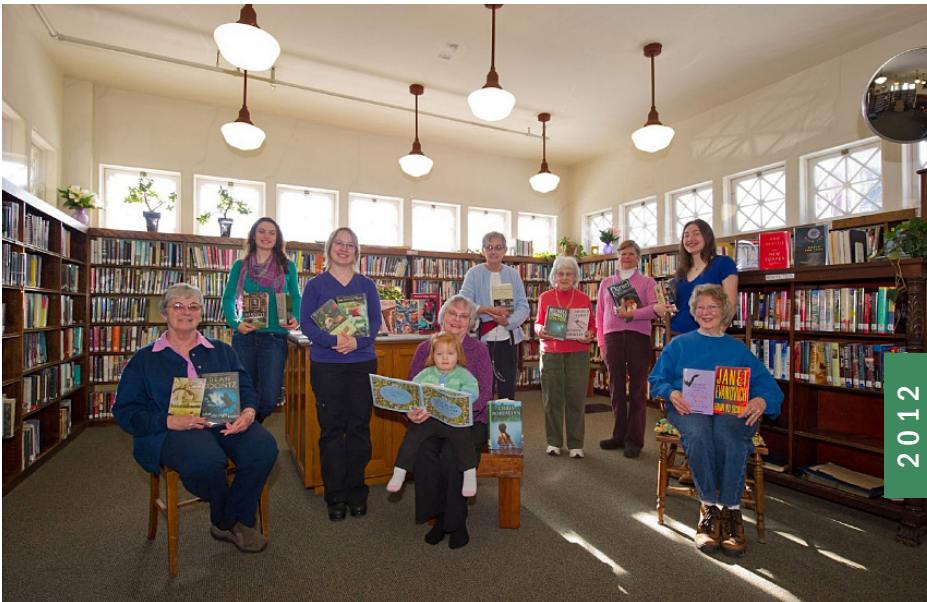
Hyde Park Free Library