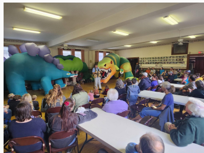
Family Programs and Events