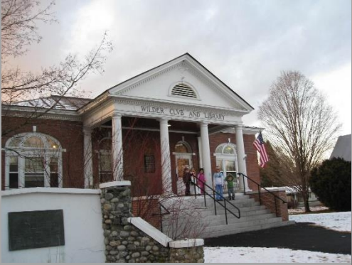
Wilder Club and Library