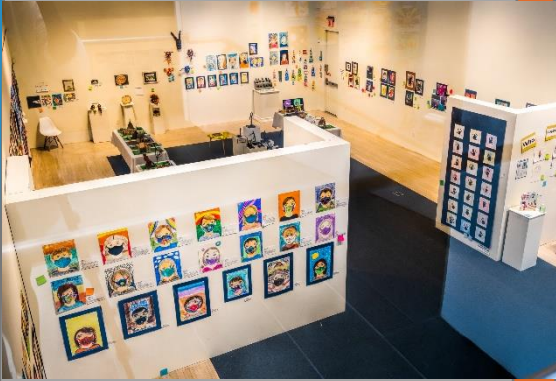
Exhibition at Southern Vermont Art Center