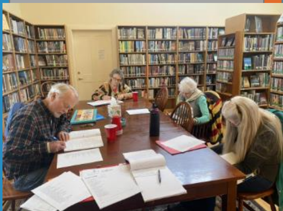
Ripe to Write Group - Tunbridge