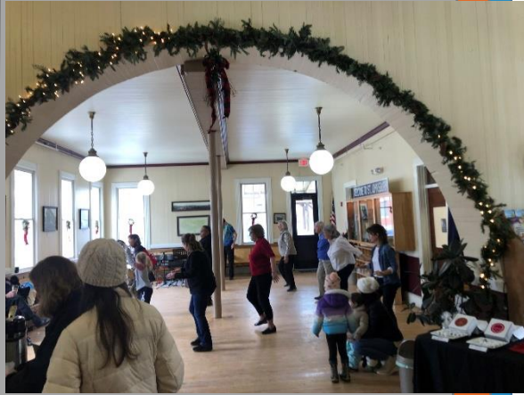
Quahog Dance Theatre